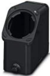
HEAVYCON EVO sleeve housing, plastic, with bayonet flange for EVO screw connection, B16, for single locking latch, height: 76 mm, without EVO screw connection

Please be informed that the data shown in this PDF Document is generated from our Online Catalog. Please find the complete data in the user's documentation. Our General Terms of Use for Downloads are valid ( http://download.phoenixcontact.com )