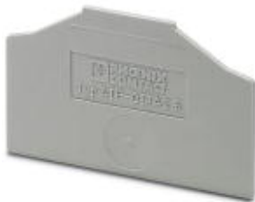
Partition plate, Length: 55 mm, Width: 1.5 mm, Height: 51 mm, Color: gray

Please be informed that the data shown in this PDF Document is generated from our Online Catalog. Please find the complete data in the user's documentation. Our General Terms of Use for Downloads are valid ( http://download.phoenixcontact.com )