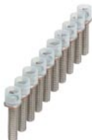
Bridge bar isolator, Number of positions: 10, Color: silver

Please be informed that the data shown in this PDF Document is generated from our Online Catalog. Please find the complete data in the user's documentation. Our General Terms of Use for Downloads are valid ( http://download.phoenixcontact.com )