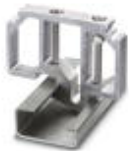
End clamp, for end support of UKH 50 - UKH 240, is pushed onto DIN rail NS 32 and fixed with 2 screws, width: 10 mm, color: Aluminum