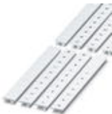
Zack marker strip, can be ordered: Strip, white, labeled according to customer specifications, Mounting type: Snap into tall marker groove, for terminal block width: 10.2 mm, Lettering field: 10.15 x 10.5 mm

Zack marker strip - ZB10,LGS:FORTL.ZAHLEN - 1053014