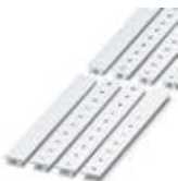
Zack marker strip, Strip, white, labeled, can be labeled with: Plotter, Printed horizontally: Consecutive numbers 1 - 10, 11 - 20, etc. up to 991 - 1000, Mounting type: Snap into tall marker groove, for terminal block width: 10.2 mm, Lettering field: 10.15 x 10.5 mm

Zack marker strip - ZB10,LGS:FORTL.ZAHLEN - 1053014