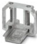
End clamp, for end support of UKH 50 to UKH 240, is pushed onto DIN rail NS 35 and fixed with 2 screws, width: 10 mm, color: aluminum