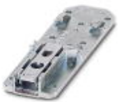
Universal DIN rail adapter

Assembly adapters - UTA 107/30 - 2320089