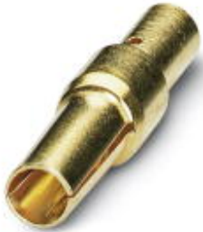
Crimp contact, turned, Single contact, Contact diameter: 1 mm, Crimp range: 0.5 mm 2 ...1 mm 2

Please be informed that the data shown in this PDF Document is generated from our Online Catalog. Please find the complete data in the user's documentation. Our General Terms of Use for Downloads are valid ( http://phoenixcontact.com/download )