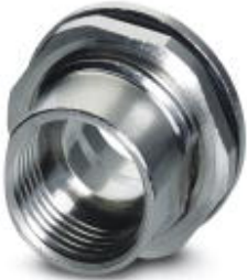
Housing screw connection, SocketLink:M12, Rear mounting, M15 x 1

Please be informed that the data shown in this PDF Document is generated from our Online Catalog. Please find the complete data in the user's documentation. Our General Terms of Use for Downloads are valid ( http://phoenixcontact.com/download )