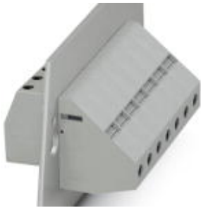
The illustration shows version HDFKV 25

Please be informed that the data shown in this PDF Document is generated from our Online Catalog. Please find the complete data in the user's documentation. Our General Terms of Use for Downloads are valid ( http://download.phoenixcontact.com )