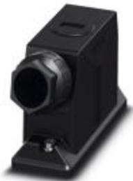
HEAVYCON ADVANCE B24 sleeve housing, with screw locking (Allen screw), plastic, height: 100 mm, with 1 x M40 thread, lateral cable outlet

Please be informed that the data shown in this PDF Document is generated from our Online Catalog. Please find the complete data in the user's documentation. Our General Terms of Use for Downloads are valid ( http://download.phoenixcontact.com )