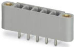
The figure shows the 5-pos. version of the product in gray

Header, Nominal current: 8 A, Rated voltage (III/2): 160 V, Number of positions: 7, Pitch: 3.81 mm, Color: black, Contact surface: Tin, Mounting: Wave soldering