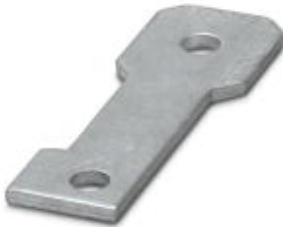
Plate for fixing the FLT-ISG-100-EX isolating spark gap to a flange, drill hole diameter of 11 mm.

Please be informed that the data shown in this PDF Document is generated from our Online Catalog. Please find the complete data in the user's documentation. Our General Terms of Use for Downloads are valid ( http://phoenixcontact.com/download )