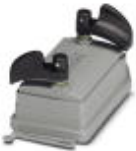
HEAVYCON ADVANCE IP65 protective cover B10, with bayonet locking, with retaining cord, diameter of retaining cord eyelet 3 mm

Protective covers - HC-B 10-TMB-SD-IP65 - 1690943