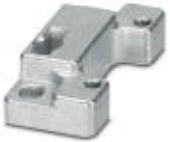
Panel mounting flange for HEAVYCON ADVANCE TMB housing with bayonet locking