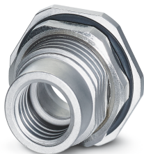
M8 socket, rear mounting

Please be informed that the data shown in this PDF Document is generated from our Online Catalog. Please find the complete data in the user's documentation. Our General Terms of Use for Downloads are valid ( http://phoenixcontact.com/download )