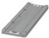
Magazine, for CMS-P1-PLOTTER, for accommodating UC-EMP..., UC-EMLP...