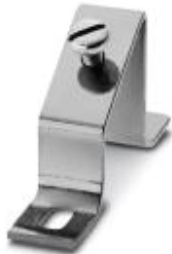
Angled brackets with M6 screw, for fixing DIN rails at an angle of 30°, height: 46 mm

Please be informed that the data shown in this PDF Document is generated from our Online Catalog. Please find the complete data in the user's documentation. Our General Terms of Use for Downloads are valid ( http://download.phoenixcontact.com )