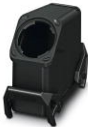
HEAVYCON EVO sleeve housing, plastic, with bayonet flange for EVO screw connection, B24, with double locking latch, height: 87.5 mm, without EVO screw connection

Please be informed that the data shown in this PDF Document is generated from our Online Catalog. Please find the complete data in the user's documentation. Our General Terms of Use for Downloads are valid ( http://download.phoenixcontact.com )