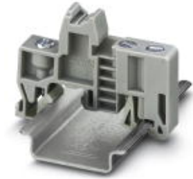
End clamp, for assembly on NS 32 or NS 35/7.5 DIN rail

Please be informed that the data shown in this PDF Document is generated from our Online Catalog. Please find the complete data in the user's documentation. Our General Terms of Use for Downloads are valid ( http://download.phoenixcontact.com )