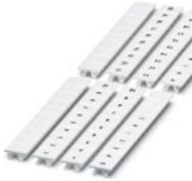
Zack marker strip, Strip, white, Labeled according to customer specifications, Mounting type: Snap into tall marker groove, For terminal block width: 8.2 mm, Lettering field: 10.5 x 8.15 mm

Please be informed that the data shown in this PDF Document is generated from our Online Catalog. Please find the complete data in the user's documentation. Our General Terms of Use for Downloads are valid ( http://download.phoenixcontact.com )