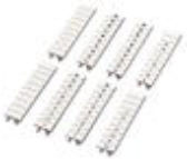
Zack marker strip, Can be ordered: Strip, white, Labeled according to customer specifications, Mounting type: Snap into tall marker groove, For terminal block width: 5.2 mm, Lettering field: 5.15 x 10.5 mm

Marker for terminal blocks - UC-TM 5 CUS - 0824581