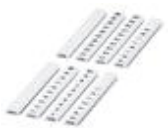
Zack Marker strip, flat, Can be ordered: Strip, white, Labeled according to customer specifications, Mounting type: Snap into flat marker groove, For terminal block width: 5 mm, Lettering field: 5.15 x 5.15 mm

Zack Marker strip, flat - ZBF 5 CUS - 0825025