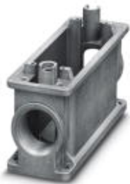
HEAVYCON ADVANCE B24 box mounting base, for M6 screw locking, salt-water-resistant aluminum, with 2 x M32 thread, without surface coating

Please be informed that the data shown in this PDF Document is generated from our Online Catalog. Please find the complete data in the user's documentation. Our General Terms of Use for Downloads are valid ( http://download.phoenixcontact.com )