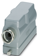
HEAVYCON B24 sleeve housing, for single locking latch, height: 76 mm, with 1 x Pg21 screw connection, lateral cable outlet

Please be informed that the data shown in this PDF Document is generated from our Online Catalog. Please find the complete data in the user's documentation. Our General Terms of Use for Downloads are valid ( http://phoenixcontact.com/download )