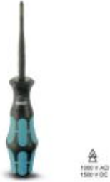
Screwdriver, crosshead PZ (lasered), insulated, size: PZ 1 x 80, 2-component handle, with non-slip grip

Please be informed that the data shown in this PDF Document is generated from our Online Catalog. Please find the complete data in the user's documentation. Our General Terms of Use for Downloads are valid ( http://download.phoenixcontact.com )