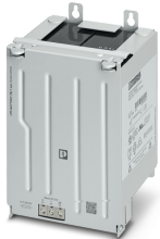
Energy storage, VRLA-AGM, 24 V DC, 7 Ah, automatic detection and communication with QUINT UPS-IQ

Please be informed that the data shown in this PDF Document is generated from our Online Catalog. Please find the complete data in the user's documentation. Our General Terms of Use for Downloads are valid ( http://phoenixcontact.com/download )