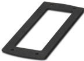
The photo shows size B16