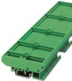
Electronic board base, plug-in module base element

Please be informed that the data shown in this PDF Document is generated from our Online Catalog. Please find the complete data in the user's documentation. Our General Terms of Use for Downloads are valid ( http://phoenixcontact.com/download )