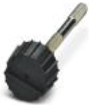
Fillister head screw with plastic knurl, M3 x 40

Screw - SAC-V-SCREW-M3-29 KNURL - 1403779