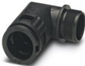
Cable gland, metric thread, IP66 protection, angled

Please be informed that the data shown in this PDF Document is generated from our Online Catalog. Please find the complete data in the user's documentation. Our General Terms of Use for Downloads are valid ( http://phoenixcontact.com/download )