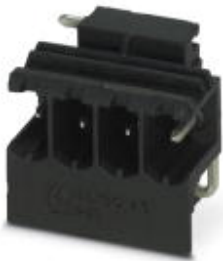
Header, Nominal current: 12 A, Rated voltage (III/2): 320 V, Number of positions: 4, Pitch: 5 mm, Mounting: Soldering, Article with lateral pin exit

Please be informed that the data shown in this PDF Document is generated from our Online Catalog. Please find the complete data in the user's documentation. Our General Terms of Use for Downloads are valid ( http://phoenixcontact.com/download )