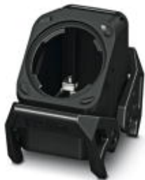
HEAVYCON EVO sleeve housing, plastic, with bayonet flange for EVO screw connection, B10, with double locking latch, height: 60.5 mm, without EVO screw connection

Please be informed that the data shown in this PDF Document is generated from our Online Catalog. Please find the complete data in the user's documentation. Our General Terms of Use for Downloads are valid ( http://download.phoenixcontact.com )