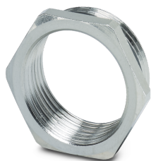
Reducing adapter, material: Brass, nickel-plated, connecting thread: Pg29, color: silver, with O-ring

Please be informed that the data shown in this PDF Document is generated from our Online Catalog. Please find the complete data in the user's documentation. Our General Terms of Use for Downloads are valid ( http://phoenixcontact.com/download )