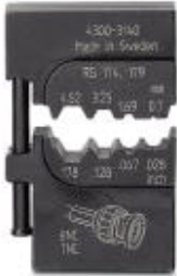
Die, for Crimpfox-M, for coaxial connectors (BNC/TNC) RG 58/ 59/ 62/ 71, packed in a serial storage box

Please be informed that the data shown in this PDF Document is generated from our Online Catalog. Please find the complete data in the user's documentation. Our General Terms of Use for Downloads are valid ( http://download.phoenixcontact.com )