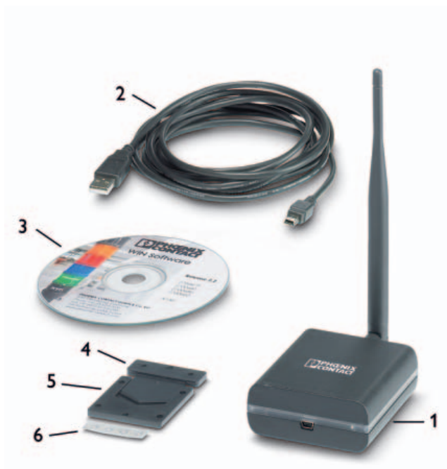
Figure 1 Elements within the scope of supply