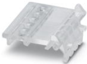
Ejector for COMBICON plug

Please be informed that the data shown in this PDF Document is generated from our Online Catalog. Please find the complete data in the user's documentation. Our General Terms of Use for Downloads are valid ( http://phoenixcontact.com/download )