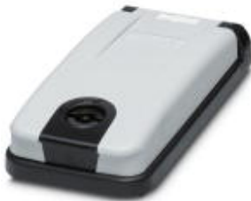
Mounting frame for one front plate/socket, frame: black, cover: gray, closed with 3 mm two-way key bit.

Please be informed that the data shown in this PDF Document is generated from our Online Catalog. Please find the complete data in the user's documentation. Our General Terms of Use for Downloads are valid ( http://phoenixcontact.com/download )