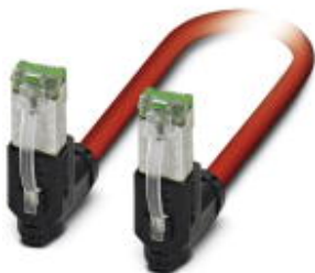
SERCOS III patch cable, shielded, star quad, AWG 22 stranded (7-wire), RAL 3020 (traffic red), RJ45 connector/IP 20, angled, to RJ45 connector/IP20, angled, length: 2.0 m

Please be informed that the data shown in this PDF Document is generated from our Online Catalog. Please find the complete data in the user's documentation. Our General Terms of Use for Downloads are valid ( http://download.phoenixcontact.com )