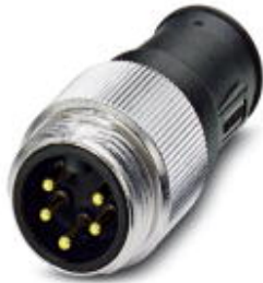
DeviceNet termination resistor, 5-pos., 7/8"-UNF connector

Please be informed that the data shown in this PDF Document is generated from our Online Catalog. Please find the complete data in the user's documentation. Our General Terms of Use for Downloads are valid ( http://download.phoenixcontact.com )