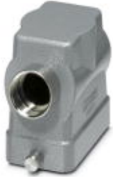
HEAVYCON sleeve housing B10, for single locking latch, height 72 mm, with support 1x M25, lateral conductor exit

Please be informed that the data shown in this PDF Document is generated from our Online Catalog. Please find the complete data in the user's documentation. Our General Terms of Use for Downloads are valid ( http://download.phoenixcontact.com )