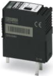
Replacement plug for PLUGTRAB PT-IQ controller for power supply

Please be informed that the data shown in this PDF Document is generated from our Online Catalog. Please find the complete data in the user's documentation. Our General Terms of Use for Downloads are valid ( http://phoenixcontact.com/download )