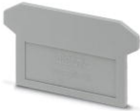
Fuse modular terminal block, Length: 64 mm, Width: 2.5 mm, Color: gray

Please be informed that the data shown in this PDF Document is generated from our Online Catalog. Please find the complete data in the user's documentation. Our General Terms of Use for Downloads are valid ( http://download.phoenixcontact.com )