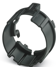
Installation connector, Range of articles: PRC 35, Color-coding, housing material: PA 6.6-FR, color: black

Please be informed that the data shown in this PDF Document is generated from our Online Catalog. Please find the complete data in the user's documentation. Our General Terms of Use for Downloads are valid ( http://phoenixcontact.com/download )