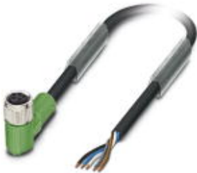
Sensor/Actuator cable, 5-position, PUR, Black-gray RAL 7021, Free cable end, on Socket angled M8, B-coded, Cable length: 10 m

Please be informed that the data shown in this PDF Document is generated from our Online Catalog. Please find the complete data in the user's documentation. Our General Terms of Use for Downloads are valid ( http://download.phoenixcontact.com )