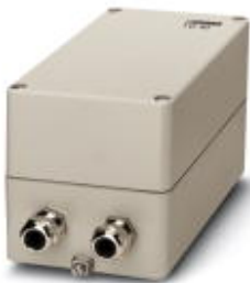
Housing for mounting surge voltage arresters

Please be informed that the data shown in this PDF Document is generated from our Online Catalog. Please find the complete data in the user's documentation. Our General Terms of Use for Downloads are valid ( http://phoenixcontact.com/download )