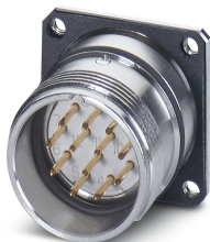
M23, Device connector, rear mounting, RC, straight, Screw locking, Flat gasket, 4xM3, Panel thickness min.: 2.7 mm, Panel thickness max.: 3.5 mm

Please be informed that the data shown in this PDF Document is generated from our Online Catalog. Please find the complete data in the user's documentation. Our General Terms of Use for Downloads are valid ( http://phoenixcontact.com/download )