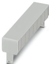
DIN rail housing, 8U, Housing cover, width: 18.9 mm, height: 87.8 mm, depth: 26 mm, color: light grey (7035)

Please be informed that the data shown in this PDF Document is generated from our Online Catalog. Please find the complete data in the user's documentation. Our General Terms of Use for Downloads are valid ( http://phoenixcontact.com/download )