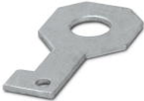
Plate for fixing the FLT-ISG-100-EX isolating spark gap to a flange, drill hole diameter of 30 mm.

Please be informed that the data shown in this PDF Document is generated from our Online Catalog. Please find the complete data in the user's documentation. Our General Terms of Use for Downloads are valid ( http://phoenixcontact.com/download )