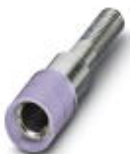
Female test connector, color: violet

Female test connector - PSBJ 4/15/6 VT - 0303383