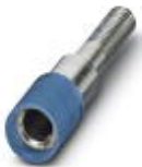
Female test connector, color: blue

Female test connector - PSBJ 4/15/6 BU - 0303354