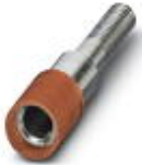
Female test connector, color: red

Female test connector - PSBJ 4/15/6 RD - 0303325