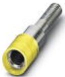
Female test connector, color: yellow

Female test connector - PSBJ 4/15/6 YE - 0303367