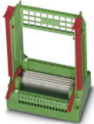
Plug-in card block, Nominal current: 4 A, Number of positions: 64, Pitch: 0 mm, Connection method: Screw connection, Color: green

Please be informed that the data shown in this PDF Document is generated from our Online Catalog. Please find the complete data in the user's documentation. Our General Terms of Use for Downloads are valid ( http://download.phoenixcontact.com )