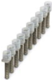
Jumper, Number of positions: 10, Color: silver

Please be informed that the data shown in this PDF Document is generated from our Online Catalog. Please find the complete data in the user's documentation. Our General Terms of Use for Downloads are valid ( http://phoenixcontact.com/download )