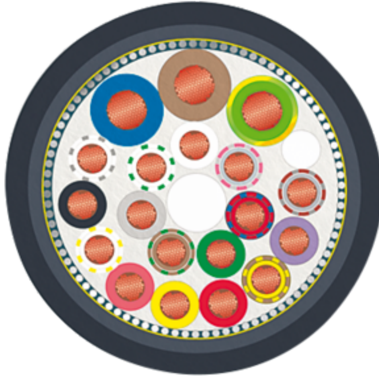
Cable cross section