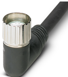
Socket M23, 19-pos., angled, shielded, with shielded, connected master cable, length: 25 m

Please be informed that the data shown in this PDF Document is generated from our Online Catalog. Please find the complete data in the user's documentation. Our General Terms of Use for Downloads are valid ( http://phoenixcontact.com/download )