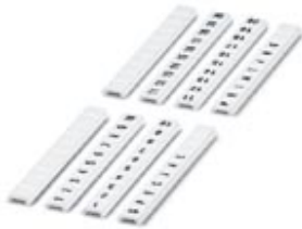
Zack Marker strip, flat, Strip, white, Unlabeled, Can be labeled with: Plotter, Mounting type: Snap into flat marker groove, For terminal block width: 5 mm, Lettering field: 5.15 x 5.15 mm

Please be informed that the data shown in this PDF Document is generated from our Online Catalog. Please find the complete data in the user's documentation. Our General Terms of Use for Downloads are valid ( http://download.phoenixcontact.com )